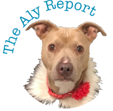
Sniffing out the lastest news from CARE STL