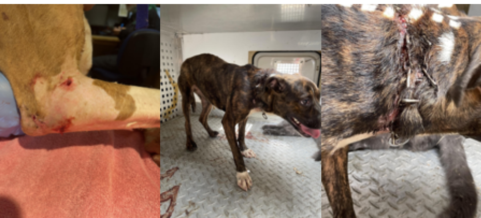
Kevlar's injured front leg