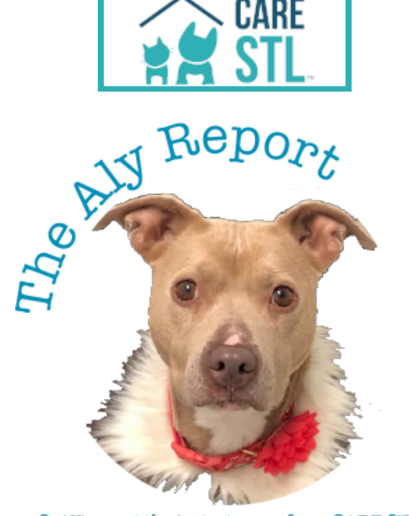
Sniffing out the lastest news from CARE STL